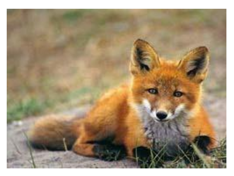
The official mascot of Marist College is the red fox.